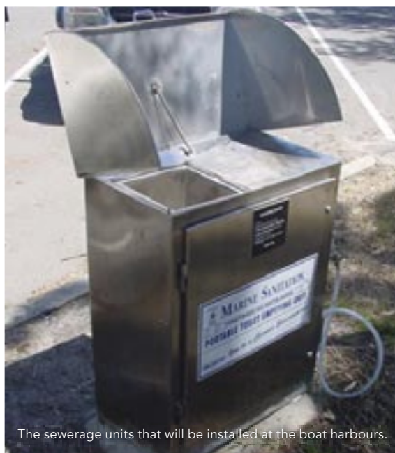
The sewerage units that will be installed at the boat harbours.

The units will be located at the public toilet blocks near the public boat ramps in each of the harbours. They are free to use 24 hours a day.