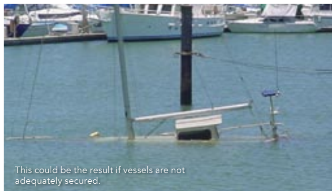
This could be the result if vessels are not adequately secured.

The storm season is fast approaching, so please ensure that the ropes on your vessel are secure and are in good condition.