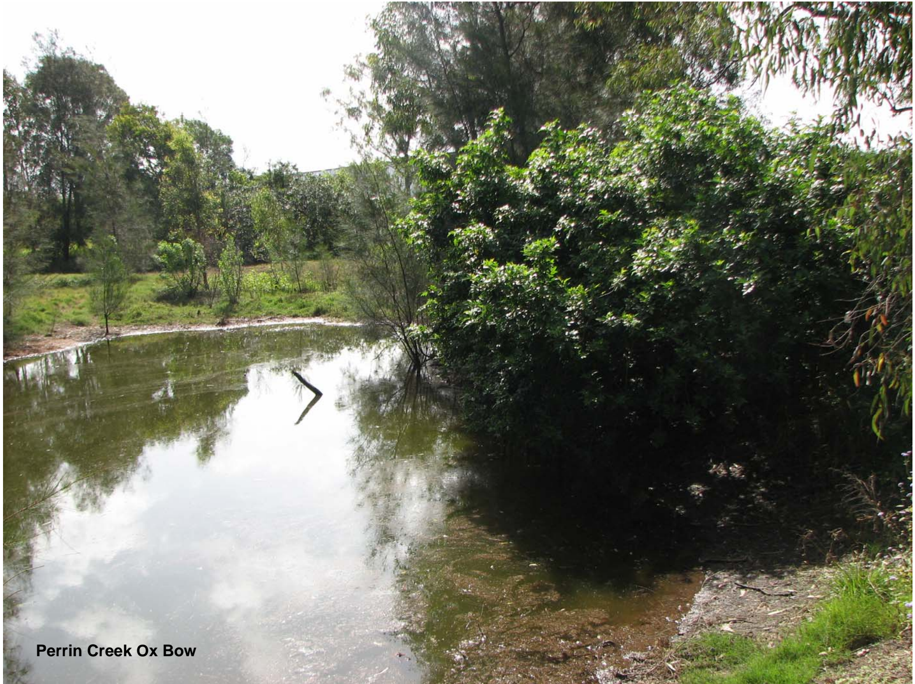
Perrin Creek Ox Bow